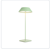
TL66714-GN Sage Green