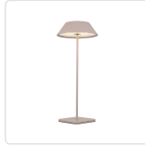
TL66714-MN Moonstone Gray