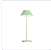
TL67914-GN Sage Green