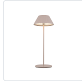
TL67914-MN Moonstone Gray